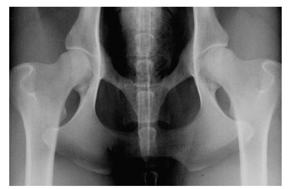
Radiograph of normal hips in a greyhound. The hip is a 'ball-and-socket' joint, the ball being the head of the thigh bone or femur, and the socket being part of the pelvis called the acetabulum. In good hips the femoral head is smoothly rounded and fits tightly and deeply into the acetabulum. The outlines of the bone are clear since there is no secondary osteoarthrosis. Compare this image with those of dysplastic joints below and on page 3.

ip dysplasia (HD) is a common inherited orthopaedic problem of dogs and a wide number of other mammals. Abnormal development of the structures that make up the hip joint leads to subsequent joint deformity. 'Dysplasia' means abnormal growth. The developmental changes appear first and because they are related to growth, they are termed primary changes. Subsequently these changes may lead to excessive wear and tear. The secondary changes may be referred to as (osteo)arthritis (OA), (osteo)arthrosis or degenerative joint disease (DJD).